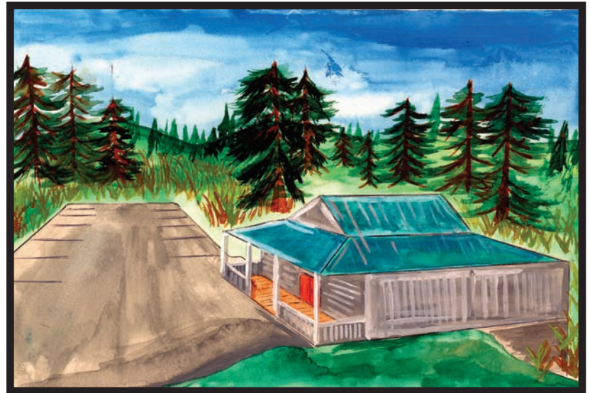
Artist's impression of planned museum building

Rezoning and subdivision of a donated piece of land have been completed. Funds are now being raised to construct a building suitable for display and archiving our collections.